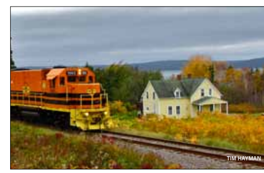
CBNS NEAR SHUNACADIE. NS.

The hearing in December will have little effect on G&W's intention to withdraw service, but