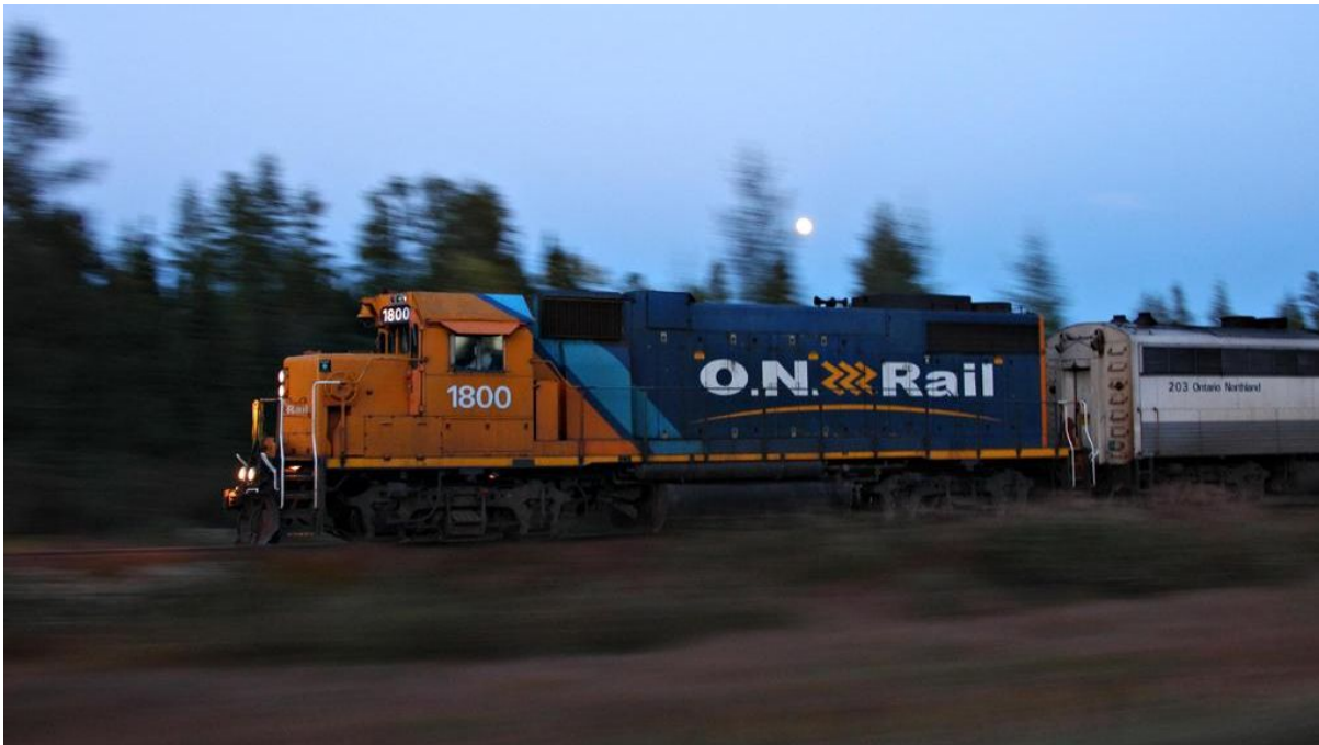
Photograph: Moon over the Northlander

Transport Action welcomes the long-awaited Initial Business Case published by MTO and Ontario Northland on May 25th. We are encouraged that the Government of Ontario plans to move forward with the restoration of passenger rail service between Toronto, the Muskoka region, and Northeastern Ontario based on the clear social equity need for this service and whole-economy spin-off benefits for the north. However, we note that "a potential in-service date in the mid 2020s" is well behind the election promises made by the government, and we urge the Ontario government to move ahead promptly on the key steps still needed for implementation, including a train service agreement with CN and procurement of rolling stock.