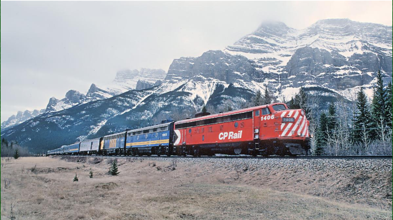
The Canadian near Canmore in 1982