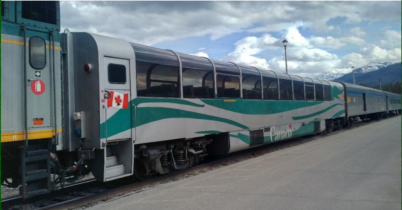
Photo: Panorama Car - One of only three accessible single-level domes in the VIA fleet