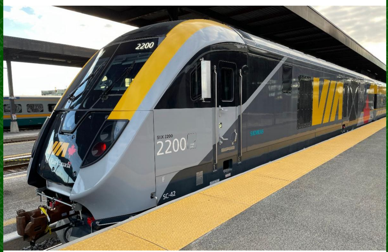
Siemens SC42 locomotive 2200