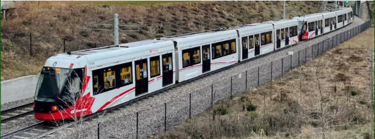
Confederation Line train leaving Tremblay