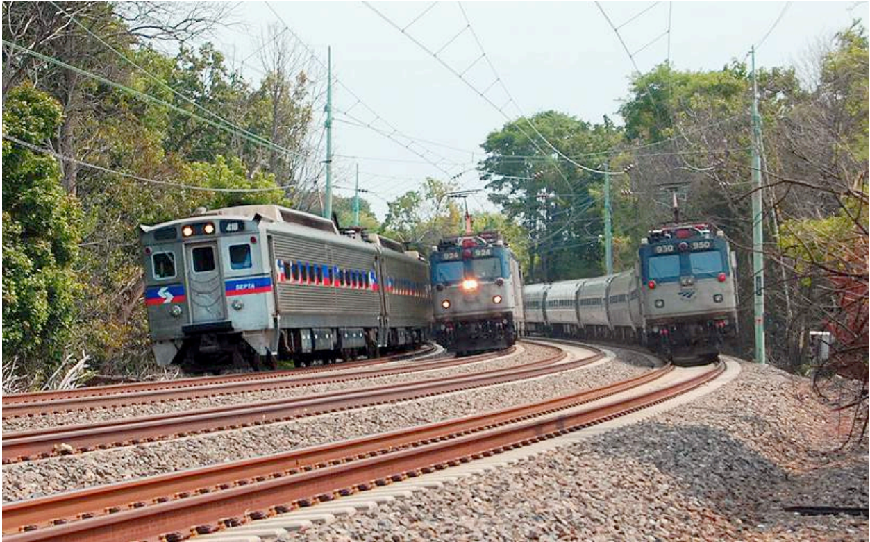
TWO OF HPR'S MANY FACES: Amtrak's electrified Northeast and Keystone corridors (above) represent the upper end of HPR operation in North America today, handling a mixture of higher-speed express services and lower-speed regional intercity trains, as well as heavy commuter and limited freight traffic. An alternate, lower-cost example is the San Jose-Sacramento Capitol Corridor (below), which offers frequent diesel-powered service with bi-level rolling stock on a line that comfortably handles heavy rail traffic.