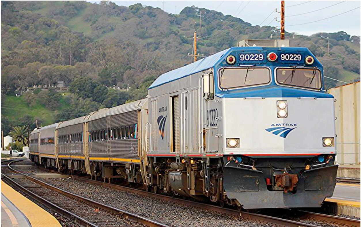
LOW-COST, MAKESHIFT PUSH-PULL OPERATION: In the absence of purpose-built HPR equipment, there are short-term methods for converting VIA’s uni-directional trainsets to push-pull operation. One is the Amtrak approach (above), which involves converting life-expired locomotives to un-powered cab cars. Another one that has been occasionally employed by VIA (below) simply uses locomotives on both ends of a trainset.